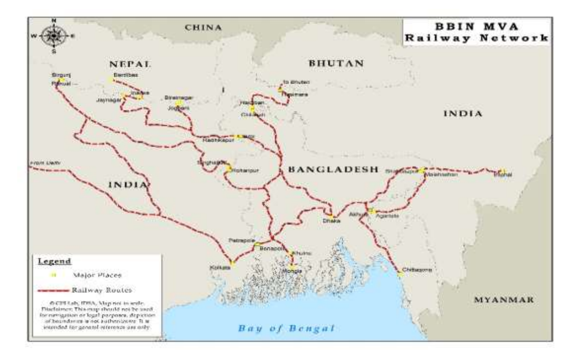
Figure-4: BBIN-MVA Railway Network

This route will enable Nepal to reactivate its cultural linkages and its economy could get a boost from tourism from Buddhist dominated countries, apart from benefitting from the transit trade.