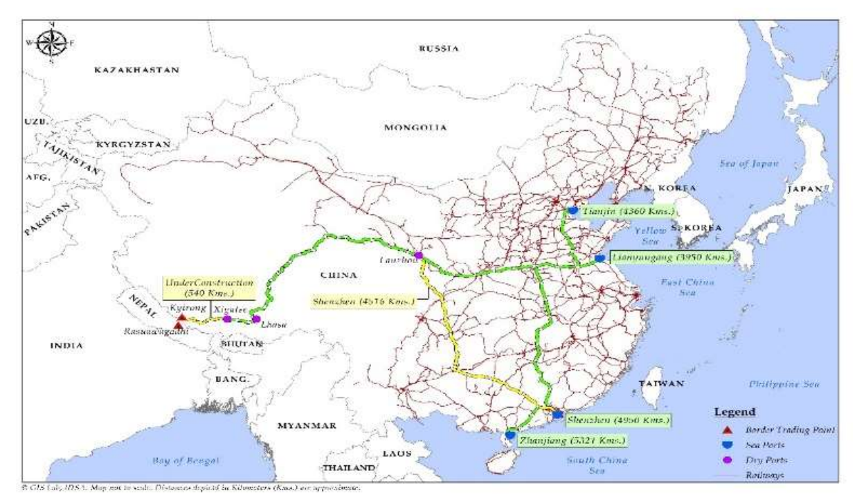
Figure-1: Nepal-China road distance map

Note : Distance calculated in this map is only from Xigatse to four sea ports.