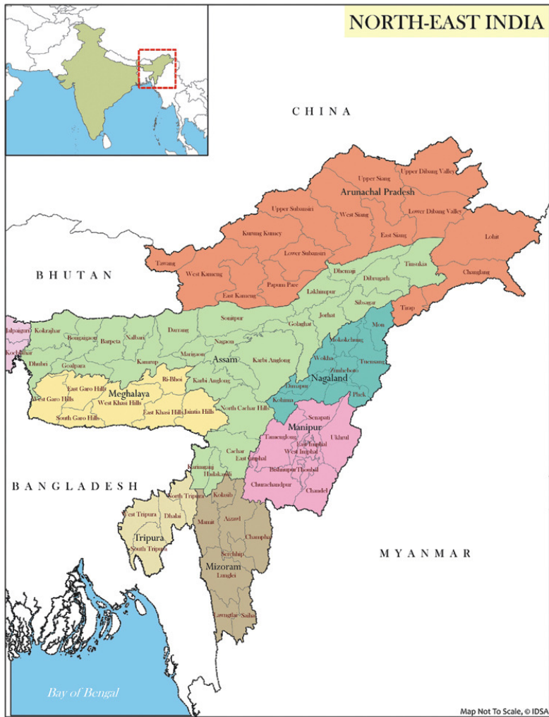
Figure III: Northeast India

The NSCN (IM) takes the help of the Karen National Union (KNU) fighting the Myanmar junta since 1949. 66 The outfit has also ventured