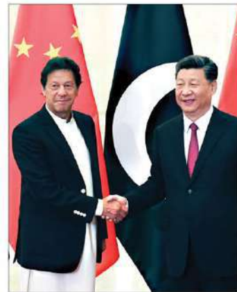
Imran Khan with Xi Jinping.

months ago and was "definitely" not organic or spontaneous. "Pakistan is perpetually engaged in a war with India. Since it cannot win a conventional war against India, it has for the last 10-15 years, has focused on strengthening its hold on psy-warfare. And due to this, it is at this stage, miles ahead of India when it comes to using Twitter-like platforms to dent India's soft power image. Unfortunately, the people in our organizations, who are supposed to counter such hybrid versions of psy-war, are old and have no inkling of what to do and how to do it. Their version of taking an offensive action against adversary countries is restricted to organizing mass-attacks on Twitter handles who are engaged in anti-India rhetoric," a senior official with a decades old intelligence unit told The Sunday Guardian . According to another old hand with an intelligence agency, Pakistan, in the last three-four years, had invested "massively" (the money for such investment had come from China) on building a strong network of domestic cyber warriors and on cultivating US and UK based "public relations experts" and lobbying groups. "What we are seeing right now (in context of the anti-India campaign on Twitter) is a good example of how Pakistan's investment is showing results. Lobbying and PR groups are approaching celebrities to put out content in support of the protesters, the same is then being amplified in India through the strong