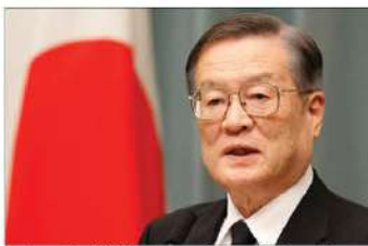
Professor Satoshi Morimoto, former Defence Minister of Japan

of influence. On the Indo-Pacific side, Far East Russia, China, and North Korea keep on expanding their military activities in East Asia. The Trump administration attempted to stop China's intelligence activities in the US from stealing sensitive high-technology, information, and property rights to increase China's advantage in the area of high-technology. PLA expands their military activities in maritime and air space. Beijing also seeks access to various countries like island countries in the Indo-Pacific region by using their financial loans, investments, bribery, intimidation, etc. In this strategic context, the United States has been promoting the Free and Open Indo-Pacific Strategy. Japan has agreed with this FOIP concept and cooperates with the US, based on the Japan-US alliance. In addition, Australia, India, Japan, and the US have been developing the Quad security dialogue to advance the FOIP strategy. Meanwhile, Beijing expresses their opposition to both the FOIP and the Quad. Q: What are the prospects of US-Japan security ties under President Joe Biden and Prime Minister Suga? Do you see the relationship between the US and Japan will strengthen further under these new leadership? A: The Biden administration aims to put emphasis on international cooperation and America's alliance partnership to recover US credibility and reliability in the world. I agree with this policy direction. On the other hand, American society has been seriously fragmented. It will be Biden's