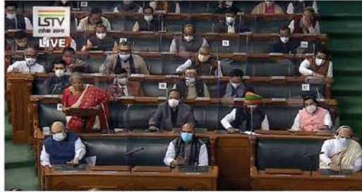
Union Finance Minister Nirmala Sitharaman presents the Union Budget 2021-22 in Lok Sabha in New Delhi on Monday.

Last year, faceless assessments and appeals were introduced, this year's Budget introduces provisions for a faceless Income Tax Appellate Tribunal to simplify the appellate procedure. All hearings (if granted) before the ITAT are now proposed to take place over video conferencing. The ITAT, being the final fact-finding authority and entrusted with a quasi-judicial function cannot work faceless. The principal of natural justice also requires a proper hearing to be given to the parties. By making the ITAT faceless the importance of this great institution is being undermined. In fact, it would be better the position of the CIT(A) is merged with the