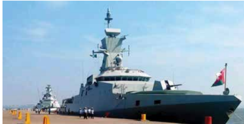
Maritime Cooperation: India-Oman conduct bilateral naval exercise Naseem-al-bahr

Thirdly, there are potentials to enhance cooperation in defence manufacturing and exports. Given the nature of security threats in South Asia and Gulf, both India and the Gulf countries import large quantities of defence equipment and weapons from third countries. Given the evolving nature of India's defence industry, the Gulf can be an attractive market. The key would be to showcase manufacturing capacity and develop confidence in the Indian defence industry. To begin with