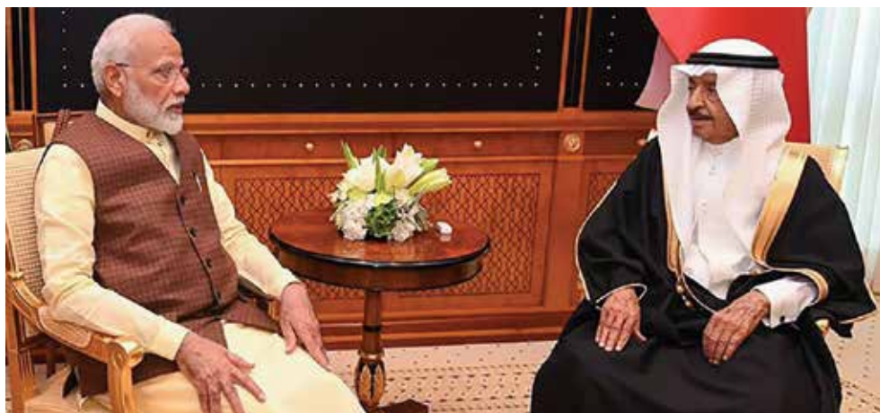
(Top) UAE gives highest civilian honour to Prime Minister Narendra Modi; PM Modi with his Bahraini counterpart Prince Khalifa bin Salman Al Khalifa, at Manama, Bahrain

extended beyond the maritime domain. A number of Omani cadets and officers have been trained in India's National Defence Academy and all three branches of the armed forces — the army, air force and navy — of India and Oman conduct joint exercises. In March 2019, the Indian Army and Royal Army of Oman conducted the third edition of joint exercise Al-Nagah in Oman. In January 2017, the five-day joint exercise Eastern Bridge between two air forces was conducted in Jamnagar, Gujarat, while the two navies conducted the 11th edition of joint naval exercise