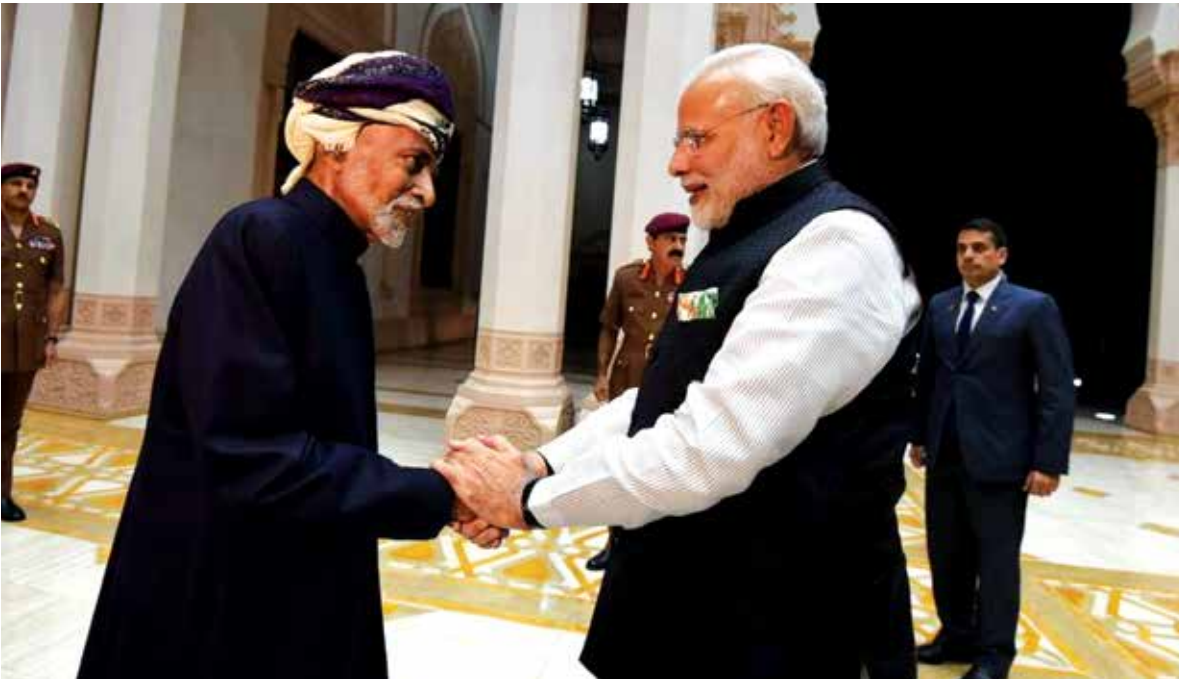
PM Modi with Omanese leader Sultan Qaboos

and increased interactions among defence officials and security analysts. The most important aspect is to have a better understanding of each other's threat perceptions. The planned joint exercises need to begin sooner while the existing exercises need to be expanded. There is immense scope in developing ties by inviting Saudi, Emirati and Omani military cadets and officers for training courses in Indian military schools.