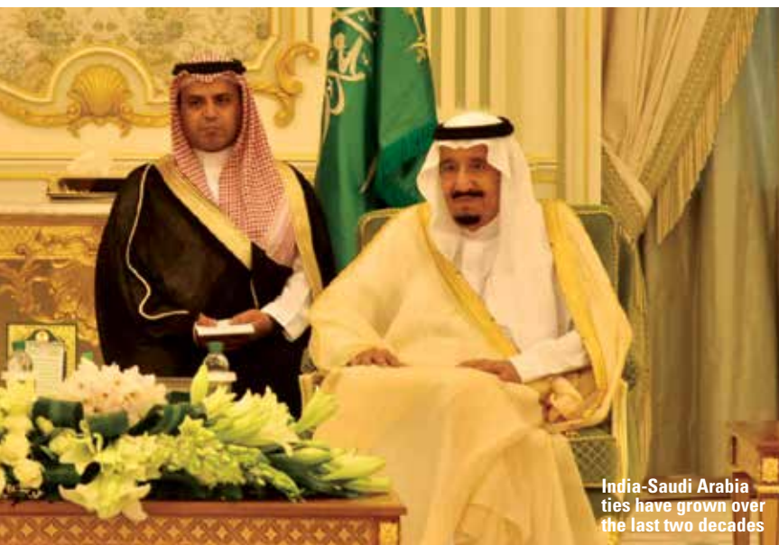
India-Saudi Arabia ties have grown over the last two decades

THE UAE, ALONG WITH SAUDI ARABIA, HAS EMERGED AS INDIA'S PREFERRED PARTNER IN THE GULF FOR COOPERATION IN COUNTER-TERRORISM WITH BETTER INTELLIGENCE SHARING AND COORDINATION BETWEEN ENFORCING AGENCIES