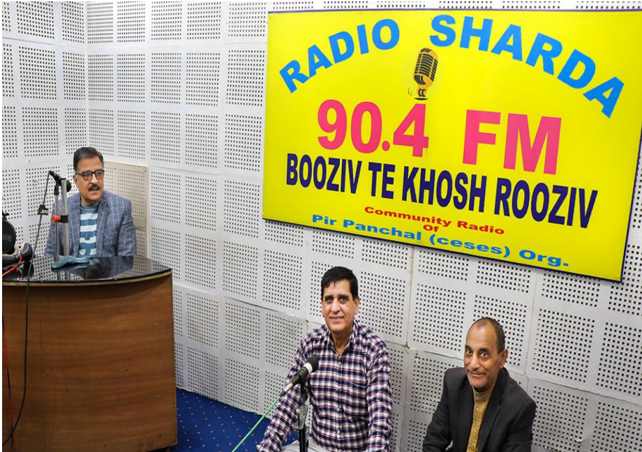
Broadcasting on 90.4FM, Radio Sharda airing views of the Kashmiri Pandit community under the tagline 'Booziv Te Khosh Rooziv' (Listen and Be Happy)'.

Radio Sharda, a community radio station based in Jammu, has become a significant platform for the Kashmiri Pandit community as people from different parts of the world listen to it to reconnect with their heritage and traditions.