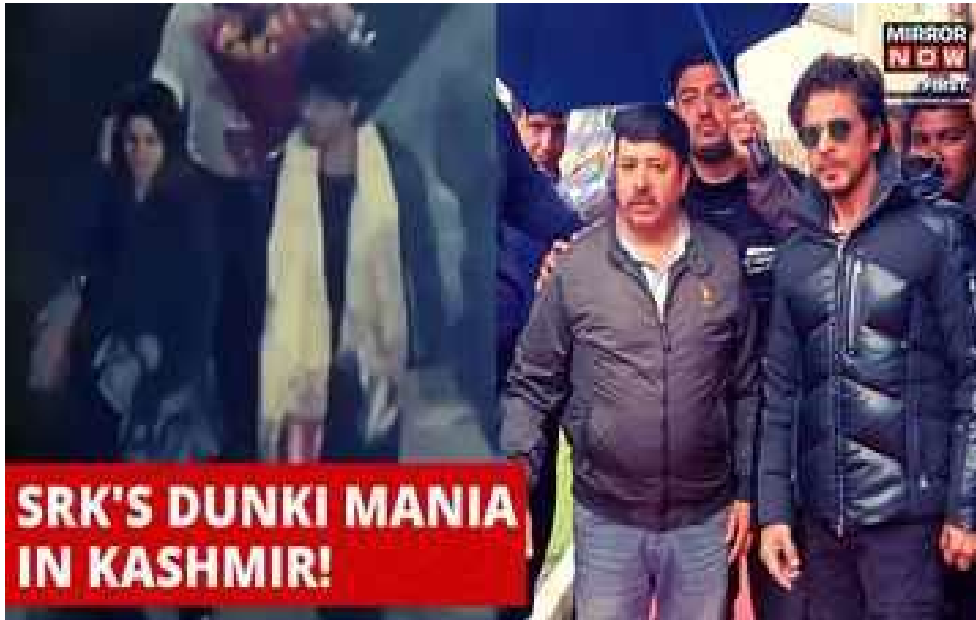
Superstars Shahrukh Khan and Taapsee Pannu recently shot for Raju Hirani's upcoming Bollywood movie 'Dunki' in Jammu and Kashmir

Jammu and Kashmir will draw film industries in a major way, as the government has identified and is developing 300 hitherto unexplored scenic destinations for film shootings.