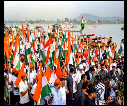
Above: Locals participating in a ‘Tiranga’ rally, on banks of Dal Lake ahead of the 77 th Independence Day on 13 August 2023. — PTI. Below: Historical Clock Tower illuminated in colours of National Flag in Srinagar on the eve of Independence Day. — PTI