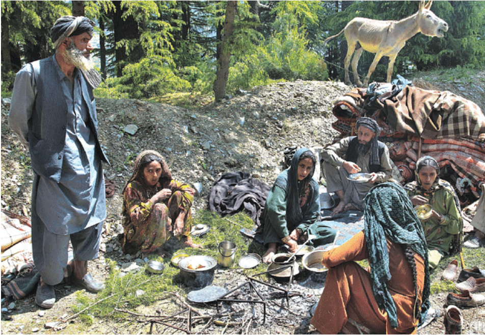
Government scheme seeks to ensure that nomadic herders in Jammu and Kashmir not only own a piece of land and have a house, but are also provided means of livelihood. — Representative picture

The Jammu and Kashmir (J&K) government, in what has been termed as a ‘landmark decision’ by observers, announced that it has approved a proposal to allot 5 marlas of land each to landless individuals who are beneficiaries of the PMAY (G) scheme.