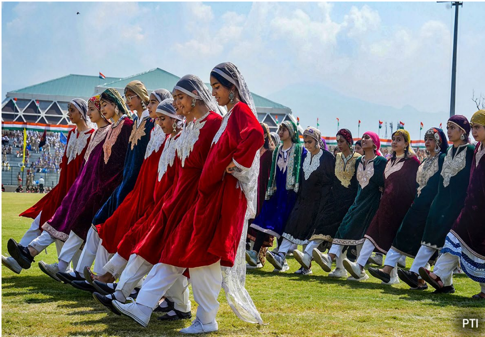
Girls in traditional Kashmiri costumes dance during Independence Day celebrations at the Bakshi stadium in Srinagar.

The Bakshi stadium in Srinagar witnessed a huge rush for celebrations held there on Independence Day. Long lines of people queued outside the stadium, even as massive crowds waved the national tricolor at the city’s iconic Lal Chowk.