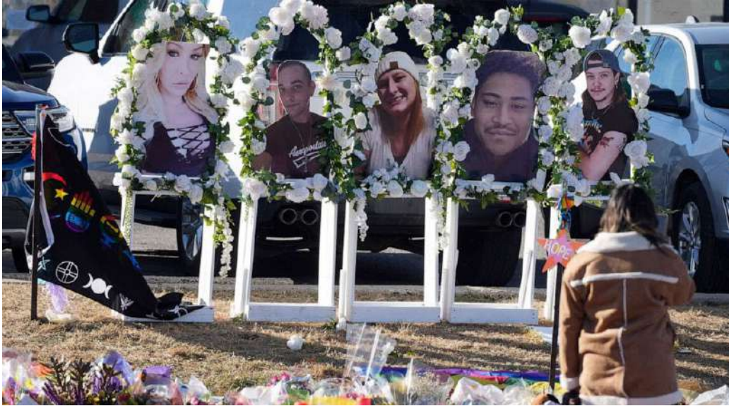
Portraits of the victims of the mass shooting at the Club Q nightclub are displayed at a memorial, Nov. 22, 2022, in Colorado Springs, Colo.

22-YEAR-OLD ALLEGEDLY FIRED SEMI-AUTOMATIC WEAPON AT LGBTQ CLUB