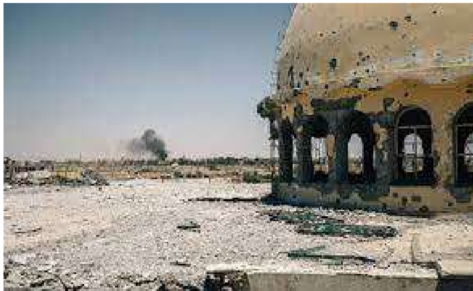
The shattered dome of a mosque in war-torn Syria. - Representation image

US MILITARY CLAIMS TERROR HONCHO KILLED BY FREE SYRIAN ARMY