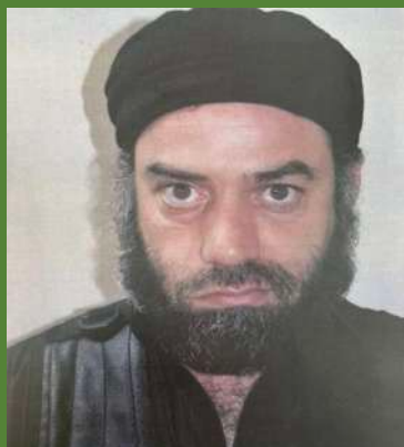
ABU HASAN AL-HASHMI AL- QURASHI

Little is known about Hasan Al Hashmi Al-Qurashi, the third slain terrorist leader of ISIS, who was an Iraqi terrorist and the Islamic State’s third “caliph.”