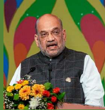
MINISTER OF HOME AFFAIRS AMIT SHAH

Delivering the Chair’s address at the conclusion of the ‘No Money for Terror’ (NMFT) conference, the Indian Minister of Home Affairs, Mr. Amit Shah, proposed the establishment of a permanent secretariat to sustain the continued global focus on counter-terrorism financing. In addition, he said that “India will circulate a discussion paper to all participating jurisdictions for their valuable comments (in this regard).”