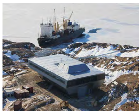
Bharti Research Station

On 18 March, 2012 India commissioned its third advanced research base ' Bharati ' about 3000 km East of Maitri station. It is located between Thala Fjord & Quilty bay, East of Stormes Peninsula in Antarctica at 69^{\circ} 24.41' S , 76^{\circ} 11.72' E at about 35 m above sea level. Bharati since its commissioning has facilitated year-round scientific research activity by the Indian Antarctic program. India's Bharati Station can accommodate 47 personnel on twin sharing basis in the main building during summer as well as in winter.