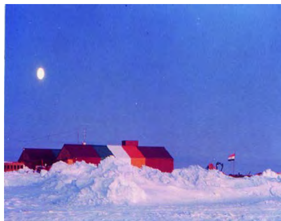
Dakshin Gangotri Research Station

India sent its first expedition to Antarctica in 1981. Two years later on 19th August, 1983 India signed the Antarctic Treaty and constructed its first research base, Dakshin Gangotri in January 1984 with the help of 81 members along with the personnel from the Indian Army. Indian scientists in January 1984, also celebrated the first Republic Day at the station along with the Soviet and German scientists.