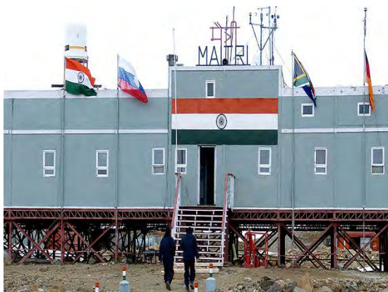
Maitri Research Station

In 1988, India build its second Antarctic research station Maitri ( 70^{\circ}45'52'' S & 11^{\circ}44'03'' E) on the rocky Schirmacher oasis. The structure of the building was built on steel stilts and has stood firm. The location of the Maitri station remains important as it serves as a gateway to one of the largest mountain chains in central Dronning Maud land, located south of Schirmacher.